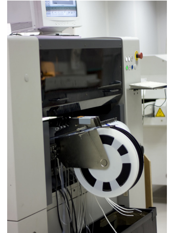
Pick & Place